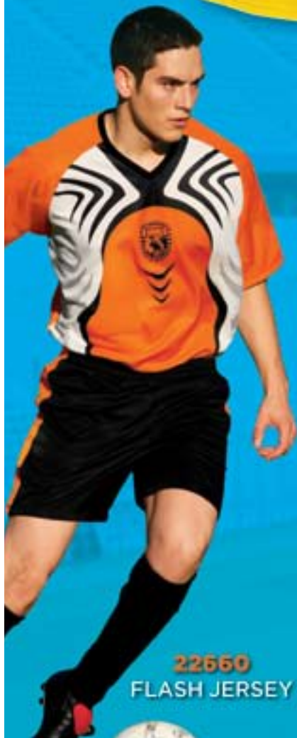
22660 FLASH JERSEY

Uniform Packages consist of a jersey, short & sock, all at one great low price. Multiple short options are available to help customize a look for any team.