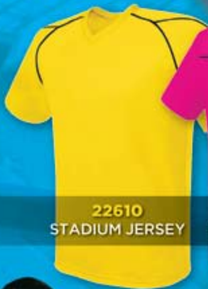
22610 STADIUM JERSEY