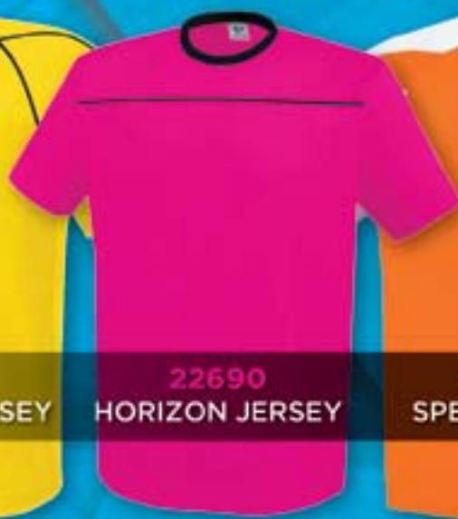
22690 HORIZON JERSEY