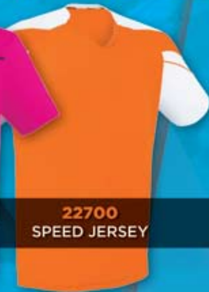
22700 SPEED JERSEY